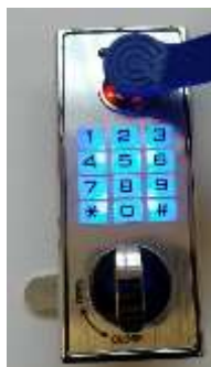
1. Use the master key until the keyboard's light is on.