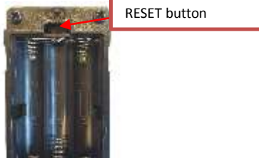
2. Insert a key on the hole where is the RESET button and keep on pressing until hearing a sound.