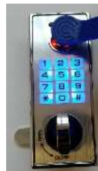
Use a new management key after the master key and before the light is off. 2. The lock emits one beep if the operation is successful.