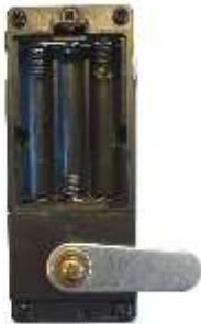
1. Remove the battery cover.