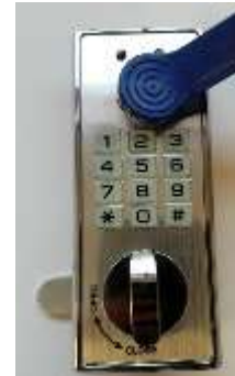
3. Use the Master key (as it is shown). If it is added successfully, the lock will emit 4 short beeps .

NOTE: The first key used after resetting will be the master key.