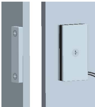
Small doors Vertical installation